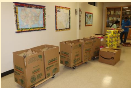
The filled boxes of over 500 completed lunch bags await transportation to Kids Meals Headquarters.