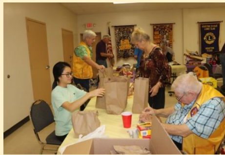
A coloring sheet and crayon were added to each bag.