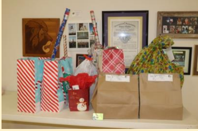
2019 Children's Christmas Assistance gifts

Houston Cy-Fair Lions again stepped up in the spirit of giving and Christmas to help 13 needy children. Names and gift wishes were picked up at the PSC meeting in Nov. Lions then purchased gifts to fulfill the wishes of children who otherwise might not have gifts at Christmas. Thanks to all who participated in this wonderful giving project. As you can see, the children will be very happy with their presents.