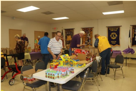
Lions packed the bags assembly line style.

Instead of having a speaker at our last meeting, we stuffed lunch bags with nutritious foods for Kids Meals organization. These lunch bags will be taken to the Kids Meals Headquarters in Houston, where a fresh meat and cheese or peanut butter and jelly sandwich will be added. Over 500 bags were packed by our dutiful dozen Lions. Each bag contains a small can of Vienna Sausage (proteins), applesauce (fruit), 100% juice box drink (fruit), pudding cup (milk), and a small bag of animal crackers for fun. Kids Meals will then add a fresh meat and cheese or peanut butter and jelly sandwich to each bag prior to delivering to the children's homes. Also in the bags we included a coloring page and a crayon, because we believe that kids minds as well as their stomach need fed. Bags were decorated by Lions prior to the filling. Lion Chuck, with the assistance others, will deliver the boxes of completed bags Mon. Dec. 2 for distribution to needy preschool children who do not have access to free breakfast and lunch like their school age peers. Thanks to all Lions who helped on this very worthwhile project.